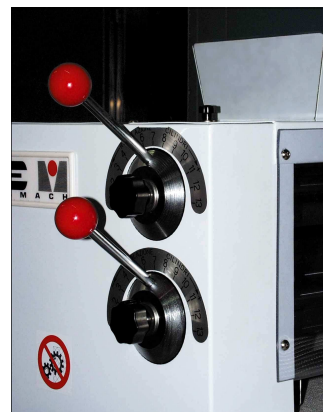
Rolling thickness adjustable lever