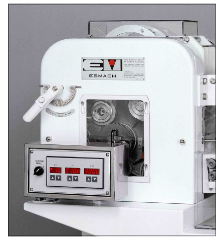
EGR-2B head and electronic control panel